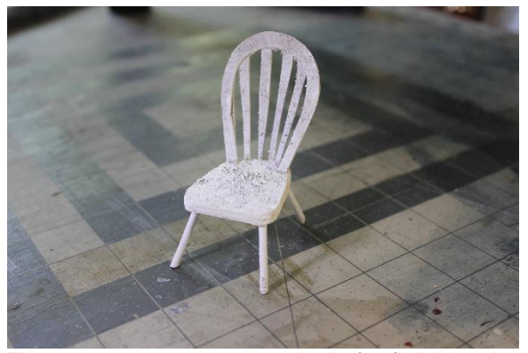
There are many, many methods for finishing the details, but for this introduction I would encourage

Once you have cut out the pieces, it is time to assemble your furniture. Use the appropriate glue for the materials you are using. I use tacky glue most often: it is affordable, easily obtainable, grabs quickly and works on all paper and wood surfaces.