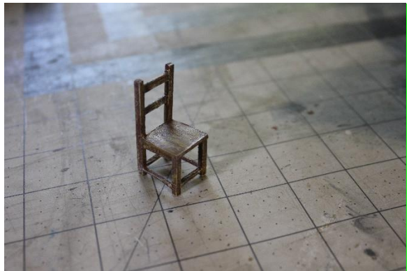
When constructing furniture, choose materials that you think will intuitively work for the object you are making. This chair was constructed entirely of mat board. Mat board is commonly used because it can be cut, painted and even sanded. Often you can make furniture from the scrap pieces you have left over after cutting walls. However, you can use any material that will work for your purposes.