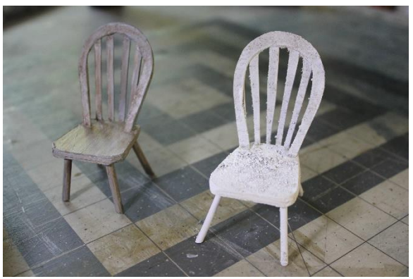
Here is an image of the same chair in a different finish. These final details make all of the difference in the feel of the object. Try different things: have fun with it!

you to simply experiment. Paint the furniture in a water based paint of your choosing, or leave it white if the finish isn't important for your purposes. Sand corners to round them or leave them square.