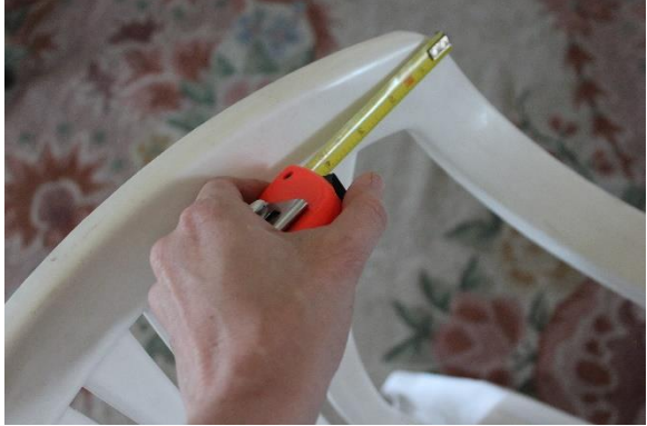
Furniture can be approached the same way as walls. Measure an object that you already have that you want to use in the space, or use standard measurements that you find online.