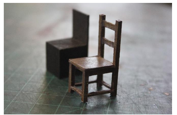
Think of your furniture as a sum of simple shapes and fill in the details from the basic measurements.